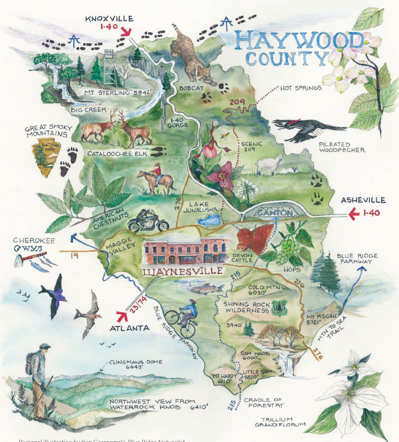
Regional illustration by Ken Czarnowski, Blue Ridge Naturalist www.facebook.com/Phoenix2Reach